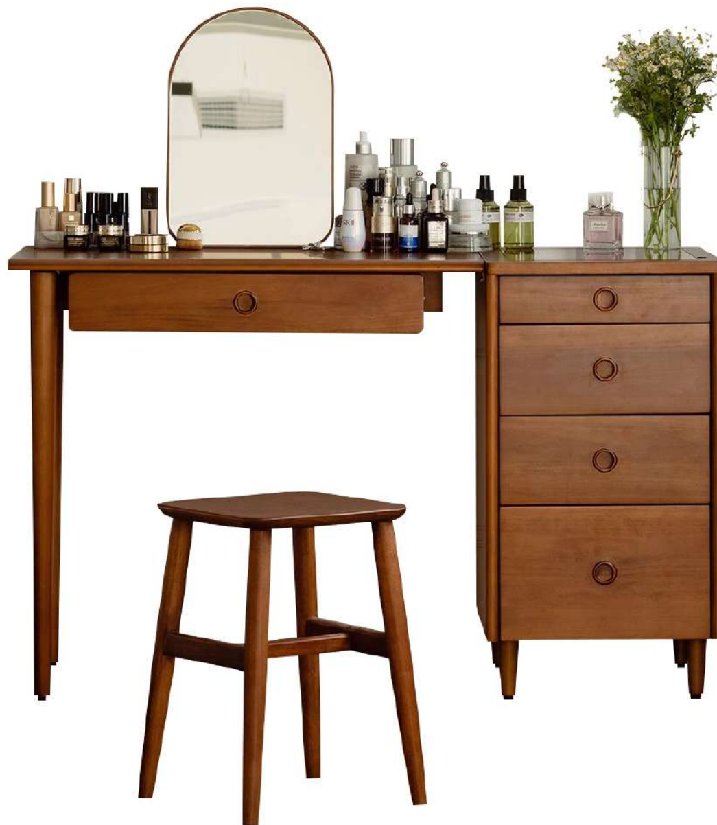
This is a modern wooden dressing table set featuring a sleek rectangular mirror, a spacious tabletop, and ample storage drawers for organizing cosmetics and accessories. It comes with a matching wooden stool that complements its elegant design. The rich walnut finish and minimalist round handles give it a warm, contemporary aesthetic, making it a perfect fit for stylish bedrooms or dressing areas.